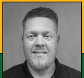
BRYAN DUMAS SUPPORT SERVICES