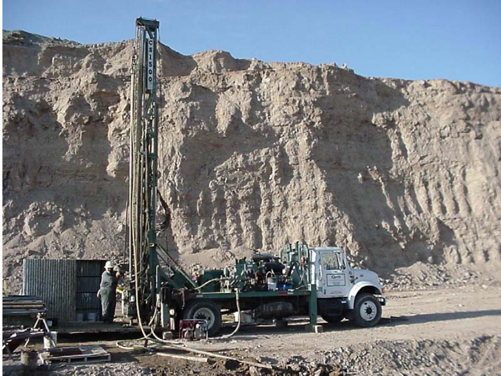
Figure 1 CS 1500 Core Drill Rig

The Centennial Series (CS) 1500, manufactured by Layne Christensen Company, is a core drilling rig capable of drilling over 1,000 feet into the earth. The main engine of the drill unit is a deck-mounted diesel. Associated equipment included with the rig is a hydraulic powered water pump, which runs off of power supplied by the drill unit engine. On-site equipment usually includes a pick-up truck, drill pipe trailer or truck, light plant for night shift work and a water truck. A two-employee crew consisting of a driller and a helper is the norm. The driller's duties are to run the rig, perform maintenance and supervise the overall operations. The helper's responsibilities include retrieving core from tubes, maintenance and making water haul runs. Crews commonly work 10-12 hour shifts.